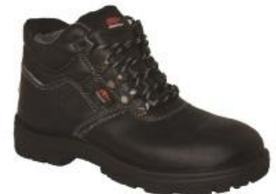
C-201 / C-201SP