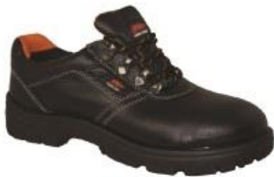
C-101 / C-101SP