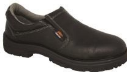
C-102 / C-102SP