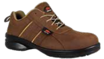
QN101KP QUEEN SERIES