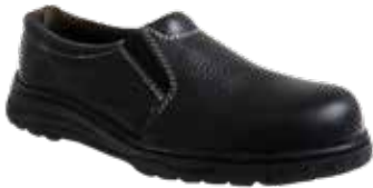
L3200SP QUEEN SERIES