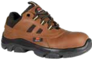
CH101KP PREMIUM SERIES