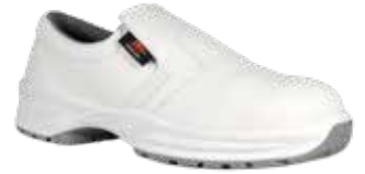
IV102SP IVORY SERIES