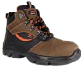
CH201KP PREMIUM SERIES