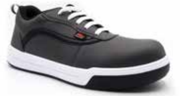
SN101KP SNEAKERS SERIES