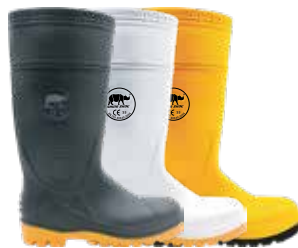
BWB302SP WATERPROOF SERIES