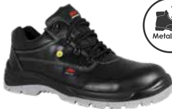
ESD101KP ESD SERIES