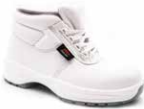
IV201SP IVORY SERIES