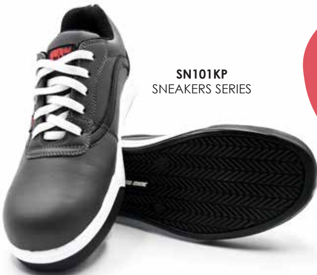
SN101KP SNEAKERS SERIES